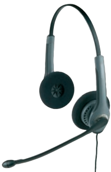
GN 2000 NC

The GN 2000 is also available with a USB connector for dedicated IP applications. Moreover, the GN 2000 USB headset gives agents true stereo-quality sound. Complete with in-line sound controls, the GN 2000 USB is a true plug-and-play product that is Microsoft Windows® compliant.