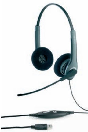
GN 2000 USB