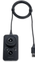
Jabra Engage Link - USB-A UC