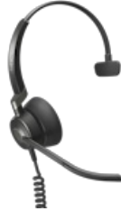
Jabra Engage 50 Mono