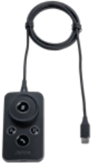
Jabra Engage Link - USB-C UC