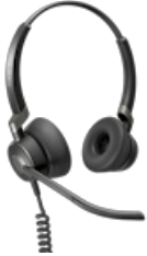
Jabra Engage 50 Stereo