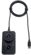
Jabra Engage Link - USB-C MS