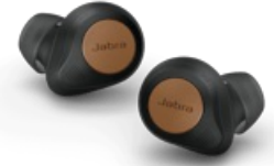
Jabra Elite 85t - Copper Black