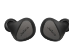
Jabra Elite 5 - Titanium Black