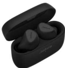
Jabra Connect 5t - Titanium Black