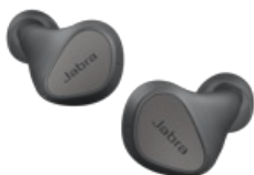
Jabra Elite 3 - Dark Grey