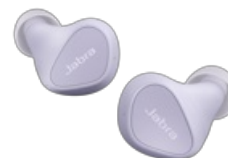
Jabra Elite 3 - Lilac