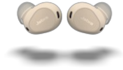
Jabra Elite 10 - Cream