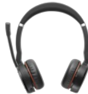
Jabra Evolve 75 SE - MS Stereo