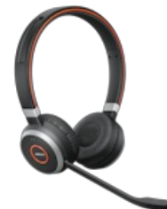
Jabra Evolve 65 MS Stereo