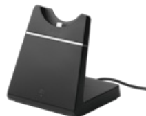
Jabra Evolve 65+ MS Stereo