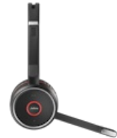
Jabra Evolve 75+ MS Stereo