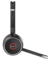
Jabra Evolve 75 MS Stereo