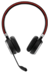
Jabra Evolve 65 SE MS Stereo