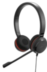
Jabra Evolve 30 II - MS Stereo