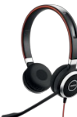
Jabra Evolve 40 UC Stereo