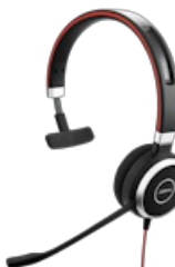
Jabra Evolve 40 UC Mono USB-C