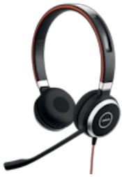
Jabra Evolve 40 UC Stereo USB-C