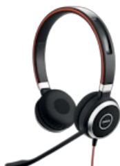
Jabra Evolve 40 MS Stereo