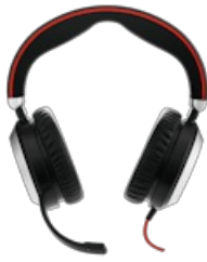
Jabra Evolve 80 MS Stereo