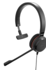
Jabra Evolve 30 II - USB-C, UC Mono