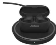
Jabra Elite 75t Wireless Charging -