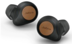
Jabra Elite 85t - Copper Black