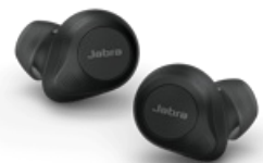
Jabra Elite 85t - Black