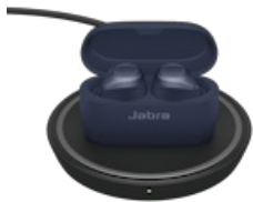
Jabra Elite Active 75t Wireless Charging -