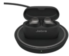
Jabra Elite 75t Wireless Charging -