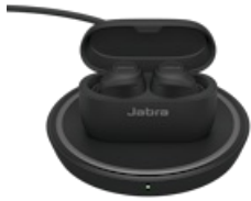
Jabra Elite 75t Wireless Charging -