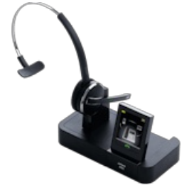
Jabra Pro 9470 Mono