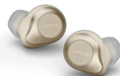
Jabra Elite 85t - Gold Beige