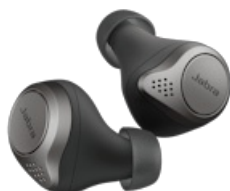
Jabra Elite 75t - Titanium Black