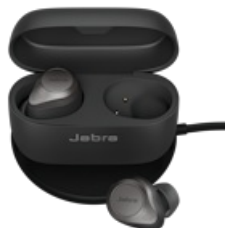
Jabra Elite 85t - Titanium Black