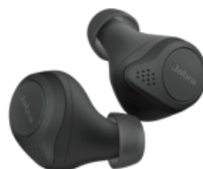
Jabra Elite 75t - Black