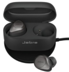
Jabra Elite 85t - Titanium Black