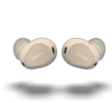
Jabra Elite 10 - Cream