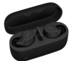
Jabra Evolve2 Buds - USB-A MS