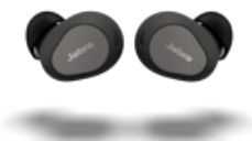
Jabra Elite 10 - Titanium Black