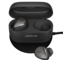
Jabra Elite 85t - Titanium Black