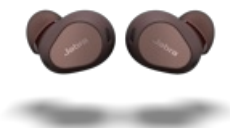
Jabra Elite 10 - Cocoa