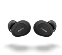
Jabra Elite 10 - Matte Black