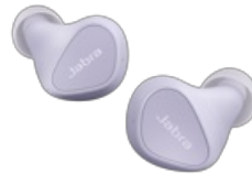
Jabra Elite 3 - Lilac