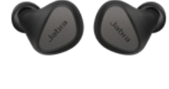
Jabra Elite 5 - Titanium Black