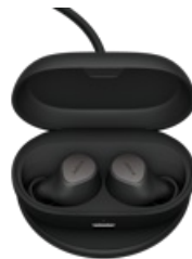
Jabra Elite 7 Pro - Titanium Black