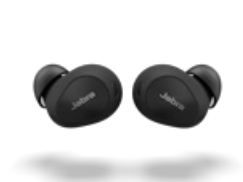
Jabra Elite 10 - Gloss Black