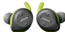
Jabra Elite Sport (Lime Green Grey)