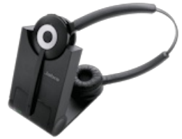
Jabra Pro 930 Duo MS