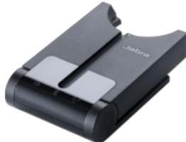
Jabra Pro 930 MS