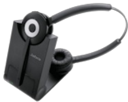
Jabra Pro 930 Duo