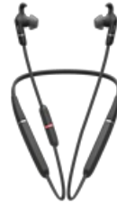
Jabra Evolve 65e MS