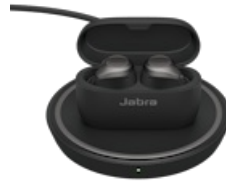
Jabra Elite 75t Wireless Charging -