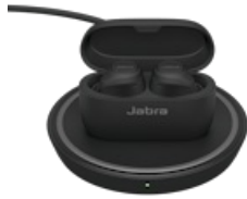
Jabra Elite 75t Wireless Charging -