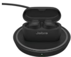
Jabra Elite 75t Wireless Charging -