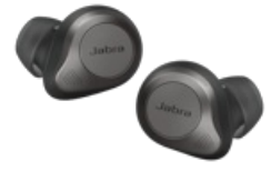
Jabra Elite 85t - Titanium Black