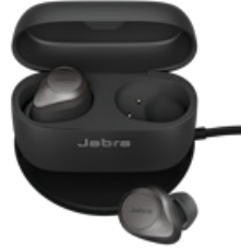
Jabra Elite 85t - Titanium Black