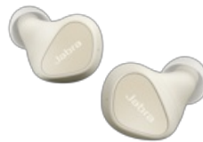
Jabra Elite 3 - Light Beige