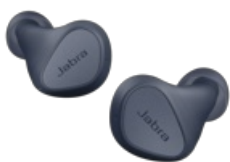
Jabra Elite 3 - Navy