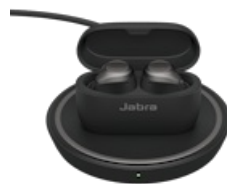
Jabra Elite 75t Wireless Charging -