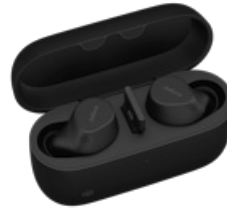
Jabra Evolve2 Buds - USB-A MS