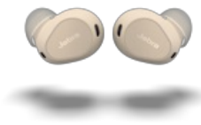
Jabra Elite 10 - Cream