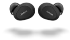
Jabra Elite 10 - Matte Black