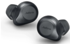
Jabra Elite 8 Active - Dark Grey