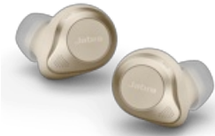
Jabra Elite 8 Active - Navy