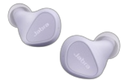
Jabra Elite 3 - Lilac