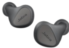
Jabra Elite 3 - Dark Grey