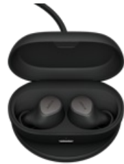
Jabra Elite 7 Pro - Titanium Black