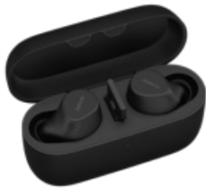
Jabra Evolve2 Buds - USB-A UC