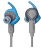
Jabra Sport Coach