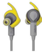
Jabra Sport Coach Wireless