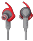
Jabra Sport Coach