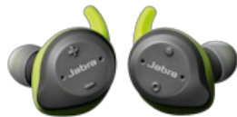
Jabra Elite Sport (Lime Green Grey)