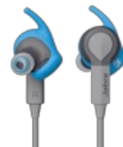
Jabra Sport Coach