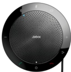
Jabra Speak 510+ MS