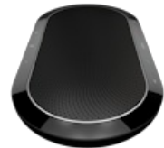
Jabra Speak 810 MS