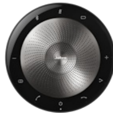
Jabra Speak 710 MS