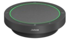
Jabra Speak2 40 - UC, Dark Grey