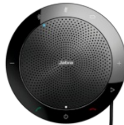
Jabra Speak 510 MS