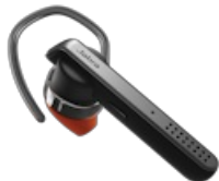
Jabra Talk 45 - Silver