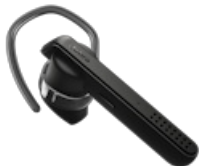
Jabra Talk 45