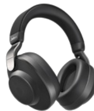
Jabra Elite 85h - Titanium Black