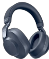
Jabra Elite 85h - Navy