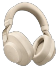
Jabra Elite 85h - Gold Beige