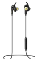
Jabra Sport Pulse Special Edition