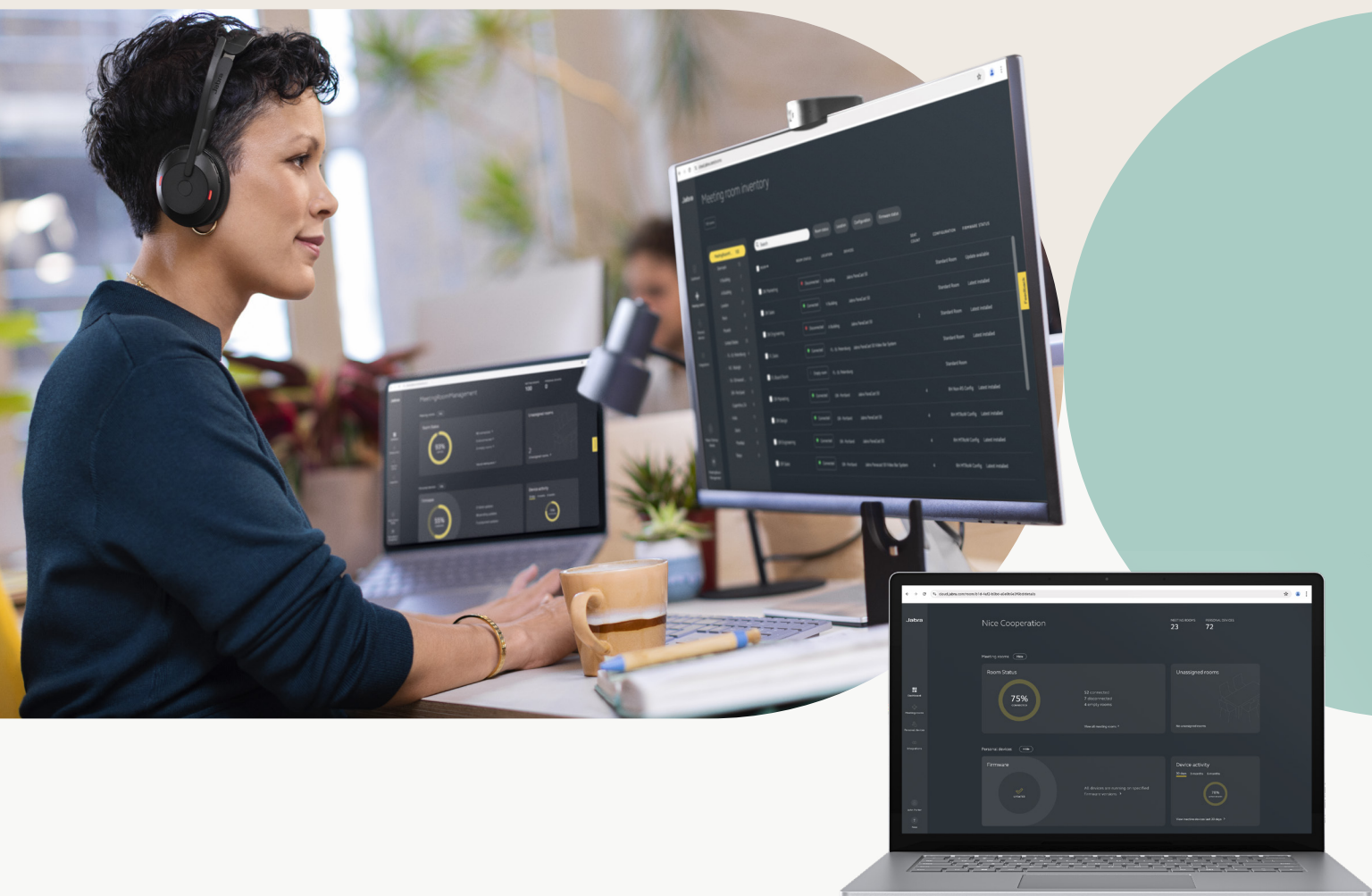
Jabra Plus Management dashboard shown