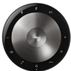
Jabra Speak 710 MS