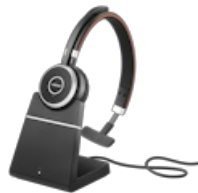
Jabra Evolve 65 SE - UC Mono with