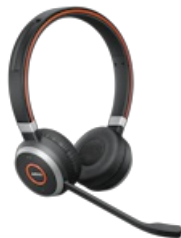
Jabra Evolve 65 MS Stereo