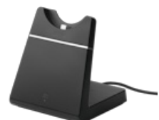
Jabra Evolve 65+ MS Stereo