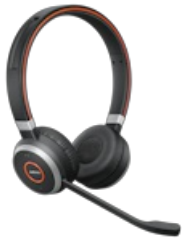
Jabra Evolve 65 SE UC Stereo