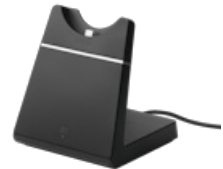
Jabra Evolve 65 SE - UC Stereo with