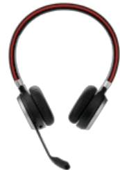
Jabra Evolve 65 SE MS Stereo