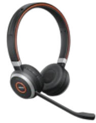
Jabra Evolve 65 MS Stereo