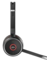
Jabra Evolve 75+ MS Stereo