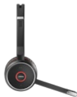
Jabra Evolve 75 MS Stereo