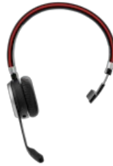
Jabra Evolve 65 UC Mono