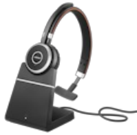
Jabra Evolve 65+ UC Mono