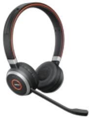
Jabra Evolve 65 MS Stereo