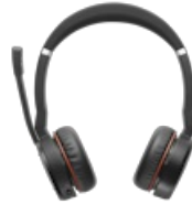
Jabra Evolve 75 SE - MS Stereo