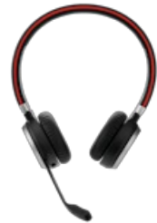
Jabra Evolve 65 SE MS Stereo