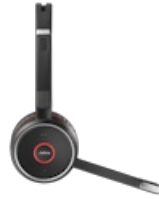
Jabra Evolve 75+ UC Stereo