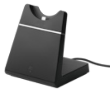
Jabra Evolve 65+ MS Stereo