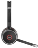
Jabra Evolve 75 UC Stereo