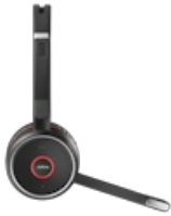
Jabra Evolve 75+ MS Stereo