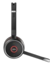
Jabra Evolve 75 MS Stereo