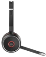
Jabra Evolve 75+ MS Stereo