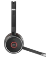
Jabra Evolve 75 MS Stereo