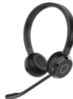
Jabra Evolve 65 TE - USB-A MS Stereo