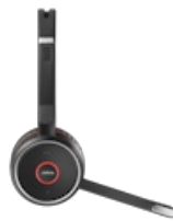
Jabra Evolve 75 MS Stereo