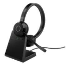
Jabra Evolve 65 TE - USB-A MS Stereo