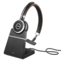
Jabra Evolve 65 SE - UC Mono with