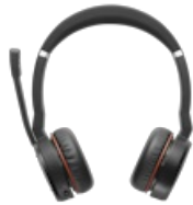
Jabra Evolve 75 SE - UC Stereo with