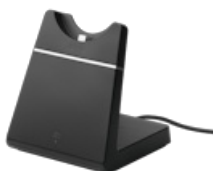
Jabra Evolve 65+ MS Stereo