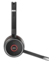
Jabra Evolve 75+ MS Stereo