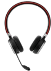
Jabra Evolve 65 SE - UC Stereo with