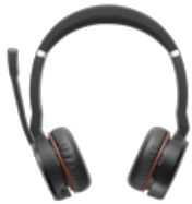
Jabra Evolve 75 SE - MS Stereo