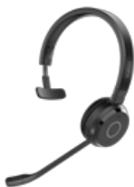
Jabra Evolve 65 TE - USB-A MS Mono