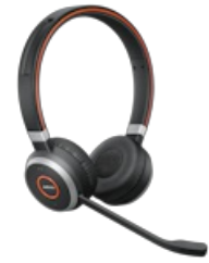
Jabra Evolve 65 MS Stereo