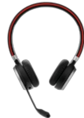
Jabra Evolve 65 SE MS Stereo