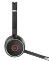
Jabra Evolve 75 MS Stereo