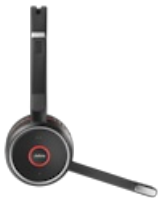
Jabra Evolve 75+ MS Stereo