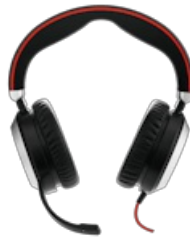
Jabra Evolve 80 MS Stereo