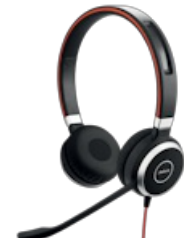
Jabra Evolve 40 MS Stereo