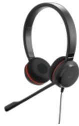
Jabra Evolve 30 II MS Stereo