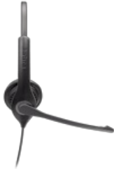
Jabra Biz 1100 EDU Duo 3.5mm