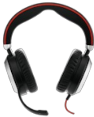
Jabra Evolve 80 UC Stereo USB-C