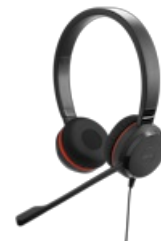
Jabra Evolve 30 II USB-C UC Stereo