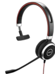
Jabra Evolve 40 UC Mono USB-C