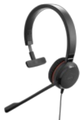
Jabra Evolve 30 II USB-C UC Mono