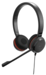
Jabra Evolve 30 II UC Stereo