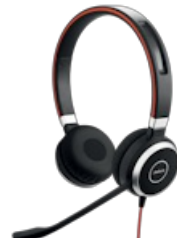
Jabra Evolve 40 UC Stereo USB-C