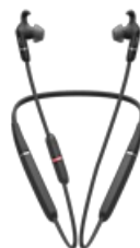
Jabra Evolve 65e MS