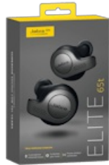
Jabra Elite 65t - Titanium Black