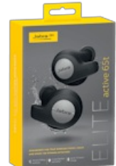
Jabra Elite Active 65t - Titanium Black