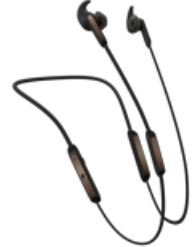
Jabra Elite 45e - Copper Black