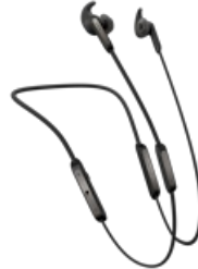
Jabra Elite 45e