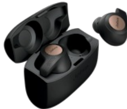
Jabra Elite Active 65t - Amazon Edition