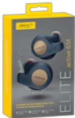
Jabra Elite Active 65t - Copper Blue