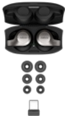
Jabra Evolve 65t UC