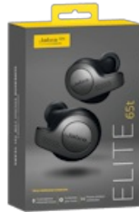
Jabra Elite 65t - Titanium Black