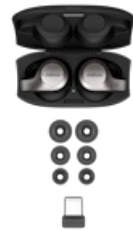
Jabra Evolve 65t MS