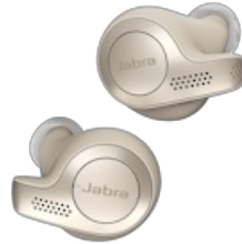
Jabra Elite 65t - Gold Beige