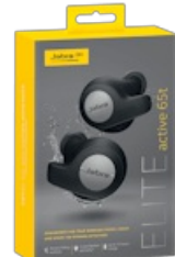
Jabra Elite Active 65t - Titanium Black