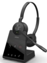
Jabra Engage 65 Stereo