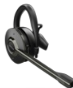
Jabra Engage 65 Convertible