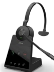
Jabra Engage 65 SE - Mono