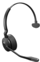
Jabra Engage 65 Mono