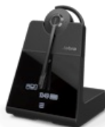
Jabra Engage 65 SE - Convertible