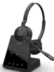
Jabra Engage 65 SE - Stereo