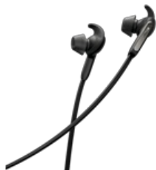
Jabra Elite 65e