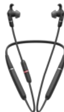
Jabra Evolve 65e MS