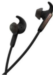
Jabra Elite 45e - Copper Black