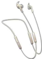
Jabra Elite 45e - Gold Beige