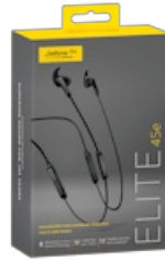
Jabra Elite 45e