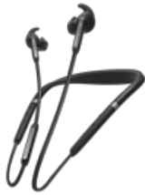
Jabra Elite 65e