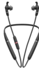
Jabra Evolve 65e MS