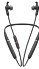
Jabra Evolve 65e UC