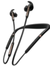
Jabra Elite 65e - Copper Black