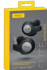
Jabra Elite Active 65t - Titanium Black