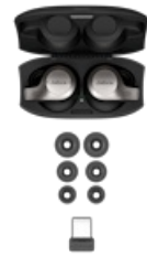
Jabra Evolve 65t MS