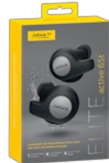
Jabra Elite Active 65t - Titanium Black