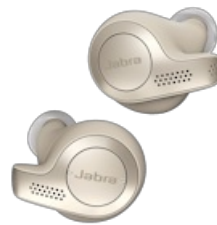
Jabra Elite 65t - Gold Beige