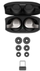
Jabra Evolve 65t MS