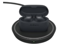
Jabra Elite Active 75t Wireless Charging -