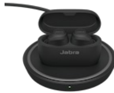
Jabra Elite 75t Wireless Charging -