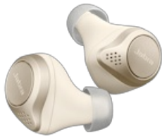
Jabra Elite 75t - Gold Beige