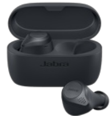
Jabra Elite Active 75t - Dark Grey