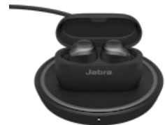
Jabra Elite 75t Wireless Charging -