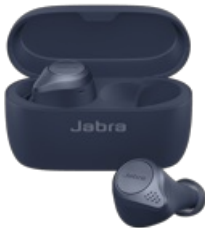
Jabra Elite Active 75t - Navy