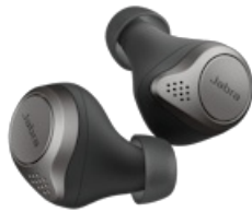
Jabra Elite 75t - Titanium Black