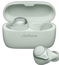
Jabra Elite Active 75t - Mint