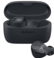
Jabra Elite Active 75t Wireless Charging -