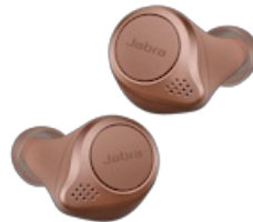
Jabra Elite Active 75t - Sienna