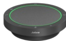
Jabra Speak2 40 MS Teams, Dark Grey