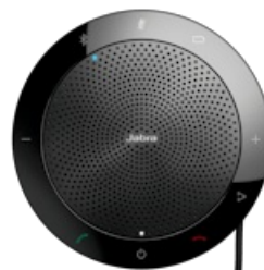
Jabra Speak 510+ MS