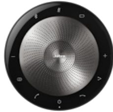
Jabra Speak 710 UC