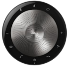
Jabra Speak 710 MS