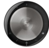
Jabra Speak 750 - MS Teams