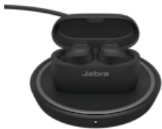
Jabra Elite 75t Wireless Charging -