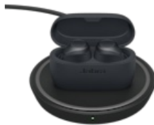
Jabra Elite Active 75t Wireless Charging -