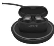
Jabra Elite 75t Wireless Charging -