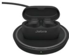
Jabra Elite 75t Wireless Charging -