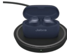
Jabra Elite Active 75t Wireless Charging -