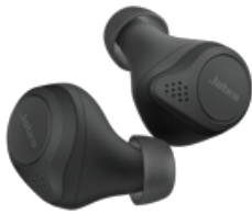
Jabra Elite 75t - Black