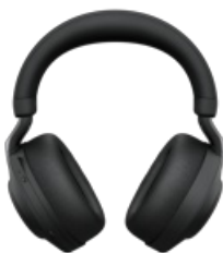
Jabra Evolve2 85 - USB-C UC Stereo -