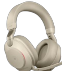
Jabra Evolve2 85 - USB-C MS Teams