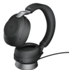
Jabra Evolve2 85 - USB-C MS Teams