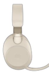
Jabra Evolve2 85 - USB-C UC Stereo -