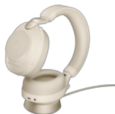
Jabra Evolve2 85 - USB-A UC Stereo with