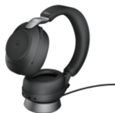
Jabra Evolve2 85 - USB-A MS Teams