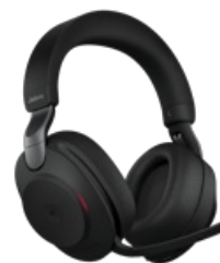
Jabra Evolve2 85 - USB-A MS Teams