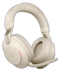
Jabra Evolve2 85 - USB-A MS Teams