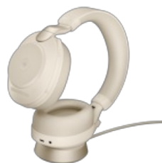
Jabra Evolve2 85 - USB-A MS Teams