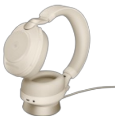
Jabra Evolve2 85 - USB-C MS Teams