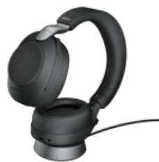
Jabra Evolve2 85 - USB-A UC Stereo