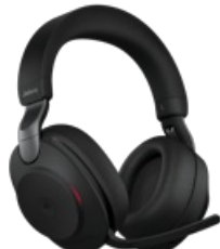
Jabra Evolve2 85 - USB-C MS Teams