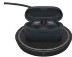
Jabra Elite Active 75t Wireless Charging -