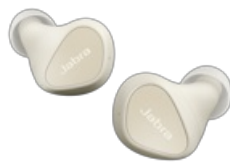
Jabra Elite 3 - Light Beige