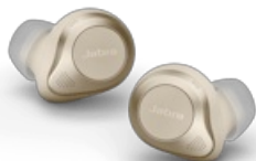
Jabra Elite 85t - Gold Beige