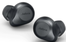
Jabra Elite 85t - Grey