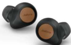
Jabra Elite 85t - Copper Black