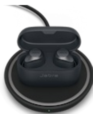
Jabra Elite 85t - Grey with 2 wireless