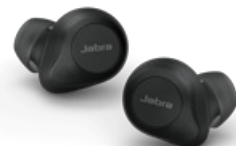
Jabra Elite 85t - Black