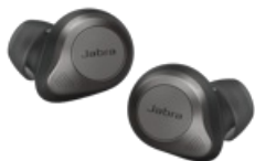
Jabra Elite 85t - Titanium Black