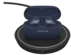
Jabra Elite Active 75t Wireless Charging -