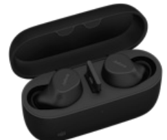
Jabra Evolve2 Buds - USB-A MS