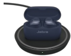
Jabra Elite Active 75t Wireless Charging -